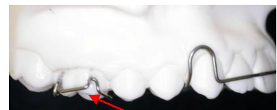
Biteplate with Adams Clasp